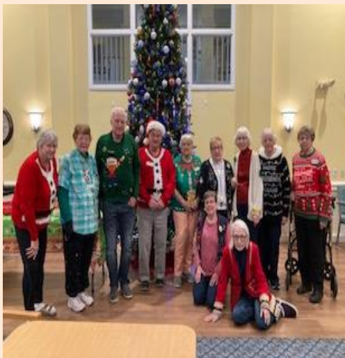
Ugly Christmas Sweaters Event on December 23rd

SCANDIA SHORES KITCHEN WILL BE CLOSED SUNDAY, JANUARY 1 ST . OFFICES CLOSED, MONDAY, JANUARY 2 ND .