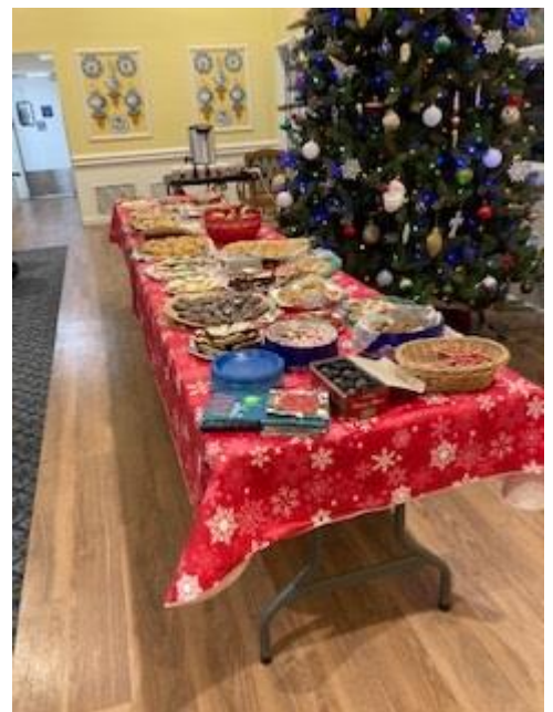
Hot Apple Cider, & Treats provided by Residents and Life Enrichment Coord.